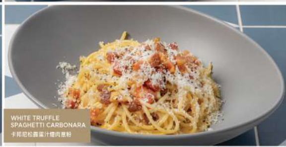
WHITE TRUFFLE SPAGHETTI CARBONARA 卡邦尼松露蛋汁煙肉意粉