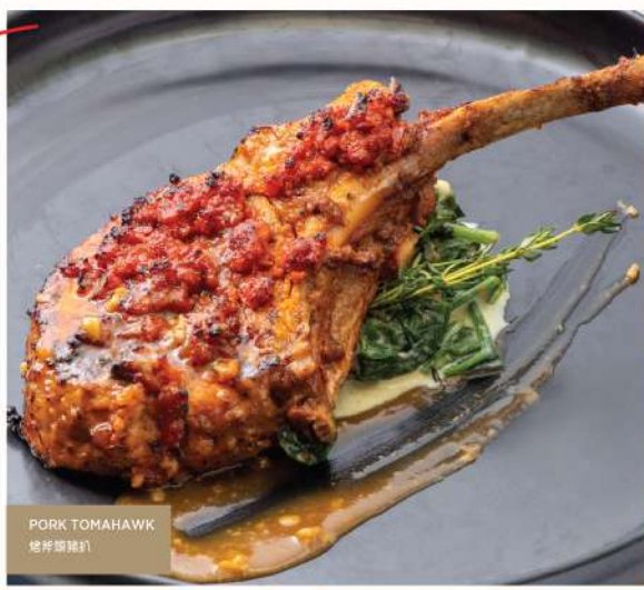
PORK TOMAHAWK 烤斧頭豬扒