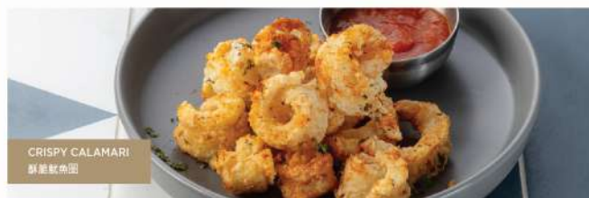
CRISPY CALAMARI 酥脆辣魷魚圈

手撕豬肉墨西哥芝士粟米薄餅 tomato salsa, guacamole, sour cream, olives