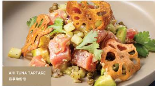
AHI TUNA TARTARE 吞拿魚他他