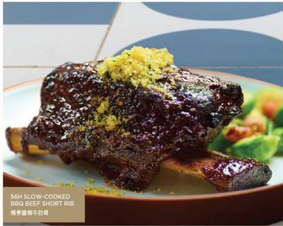
56H SLOW-COOKED BBQ BEEF SHORT RIB 慢煮醬燒牛肋骨