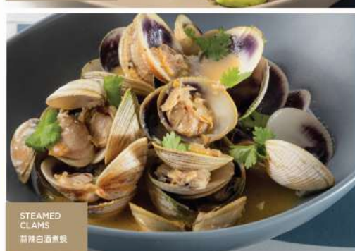
STEAMED CLAMS 蒜辣白酒煮蜆