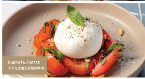
BURRATA CHEESE 水牛芝士蕃茄羅勒沙律(素)

TPP小食拼盤、秘製香料辣雞翼(4件)、酥脆辣魷魚圈(5件)、 豬皮脆片、脆豬肋骨(4件)、薯條 crispy chicken wings (4pcs), calamari (5pcs), pork skin crackers, piggy riplets (4pcs), fries