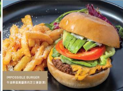
IMPOSSIBLE BURGER 牛油果蛋黃醬素肉芝士漢堡(素)