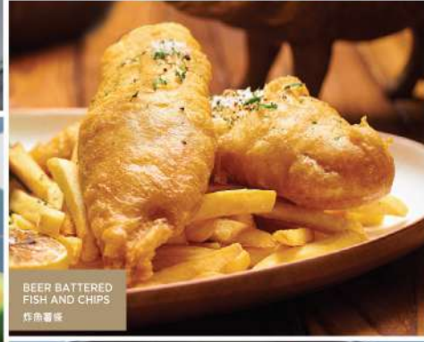
BEER BATTERED FISH AND CHIPS 炸魚薯條