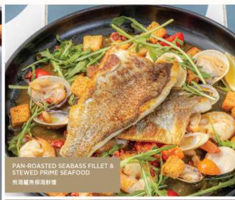
PAN-ROASTED SEABASS FILLET & STEWED PRIME SEAFOOD 煎海鱸魚柳海鮮燴