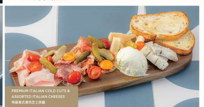
PREMIUM ITALIAN COLD CUTS & ASSORTED ITALIAN CHEESES 特級意式凍肉芝士拼盤

SIGNATURE DISH 推介 | VEGETARIAN 素食 | VEGAN 純素 | GLUTEN FREE 無麩質 | SPICY 辣