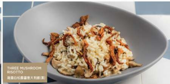
THREE MUSHROOM RISOTTO 海菌白松露醬意大利飯(素)