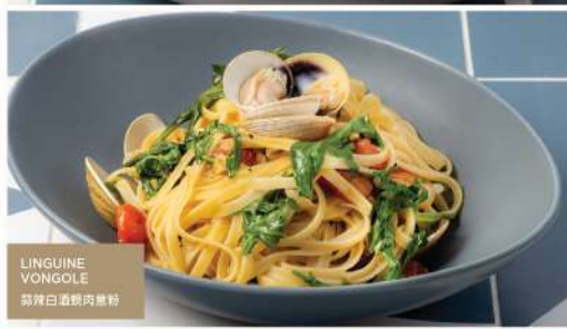
LINGUINE VONGOLE 蒜辣白酒蜆肉意粉