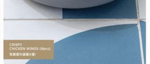
CRISPY CHICKEN WINGS (6pcs) 秘製香料辣雞翼(6隻)