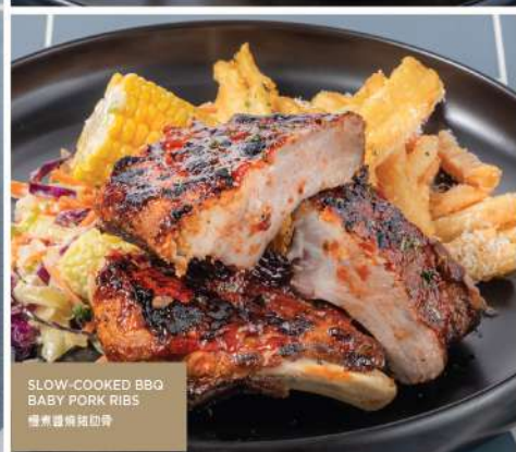
SLOW-COOKED BBQ BABY PORK RIBS 慢煮醬燒豬肋骨