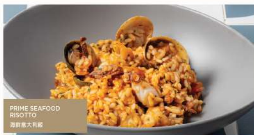
PRIME SEAFOOD RISOTTO 海鮮意大利飯