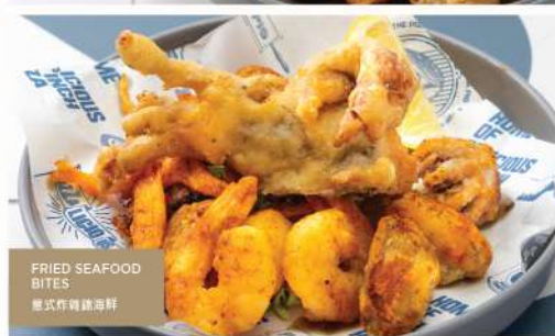
FRIED SEAFOOD BITES 意式炸雜錦海鮮