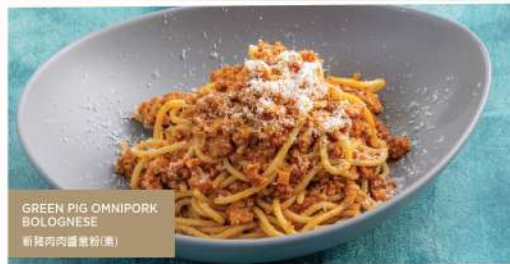
GREEN PIG OMNIPORK BOLOGNESE 煎豬肉肉醬意粉(素)