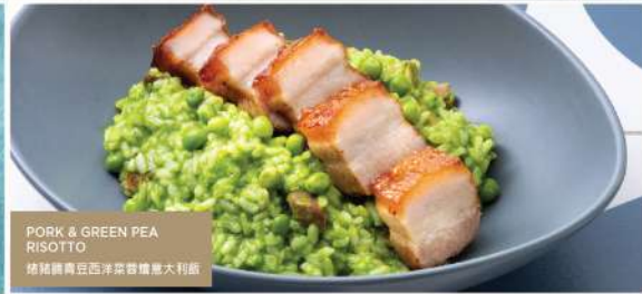
PORK & GREEN PEA RISOTTO 烤豬腩青豆西洋菜蓉燴意大利飯